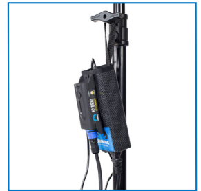
Controller + Power Supply + pouch