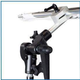
Single Axis Adapter with Panel Clamp